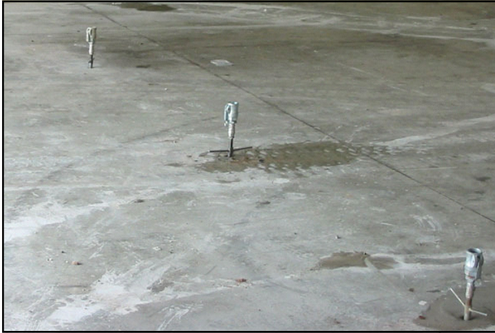
Injections can be used to fill cavities and pores in the sub-soil.